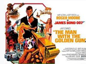
Theatrical release poster by Robert McGinnis