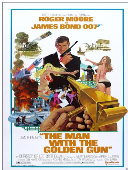
The Man with the Golden Gun